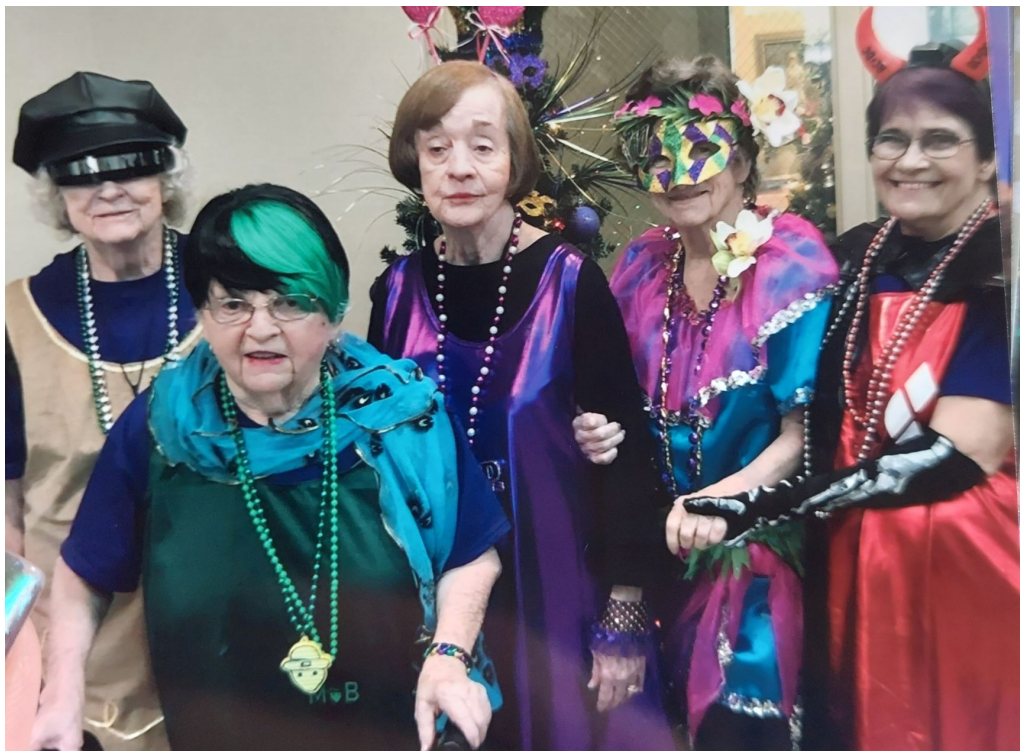
Introducing the Krewe of Knollwood Pointe Mardi Gras organization! These ladies enjoyed putting on a parade for our Memory Care Community. Laissez bon temps rouler!