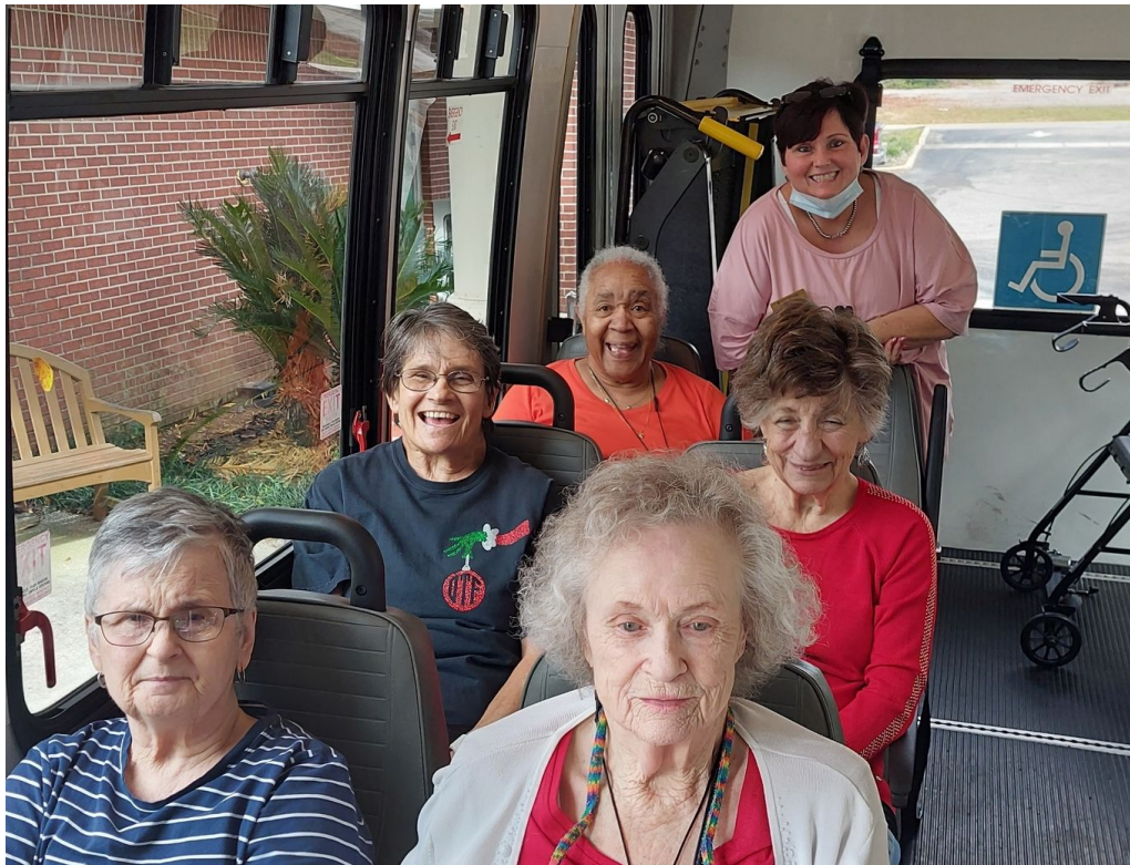
These ladies were excited to have lunch at the Cracker Barrel on their weekly bus outings.